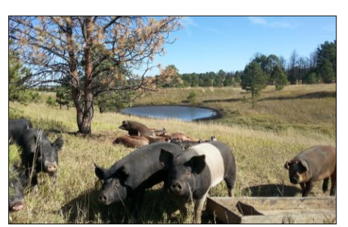
CPM pigs forage for food, plus have access to a special WW Feed & Supply custom mix.

model for herd health, Corner Post Meats sought free-choice no-corn diets